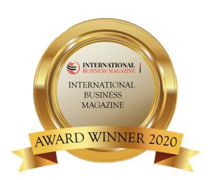
"Best SME Bank East Africa 2020" & "Best Corporate Bank Tanzania 2020"

The awards' winning criteria consider the evolution and development of banking products and services that showcase innovation.