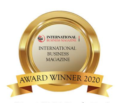
"Best SME Bank East Africa 2020" & "Best Corporate Bank Tanzania 2020"

Against the challenging backdrop of the Covid-19 pandemic, CRDB Bank has remained at the service of corporate clients and has been named the 'Best Corporate Bank in Tanzania' by the International Business Magazine. The Corporates award recognizes the continued agility, commitment, and focus of the bank's teams as a trusted partner offering support to corporates as they navigate the unprecedented times.