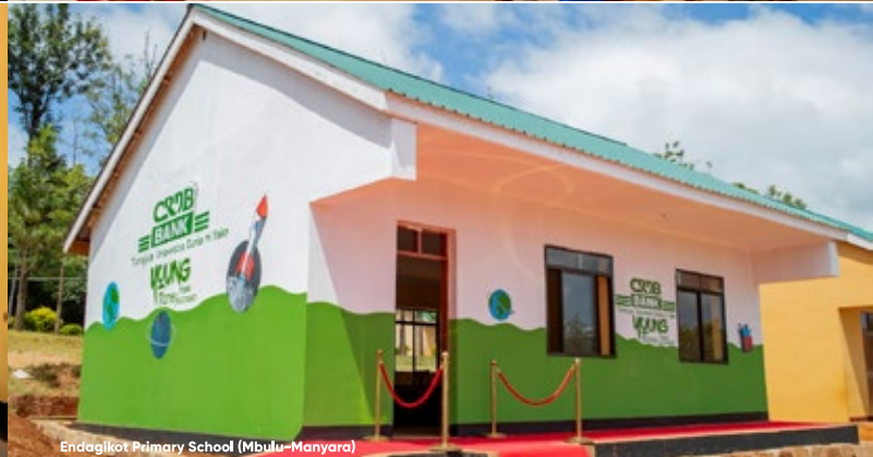
Endagikot Primary School (Mbulu-Manyara)