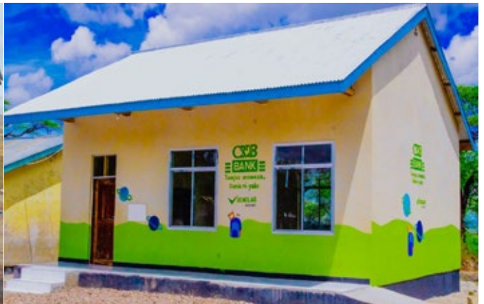
Kiloleni Primary School Shinyanga,(One class and 30desks). Handover on 09/04/2024