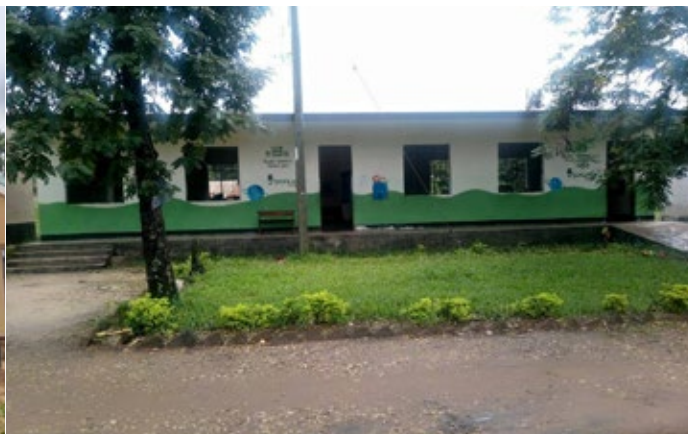
Kiloka Primary School – Morogoro, Two classes and desks. Handover planned to be in May 2024