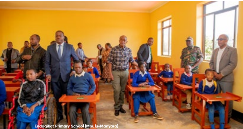
Endagikot Primary School (Mbulu-Manyara)