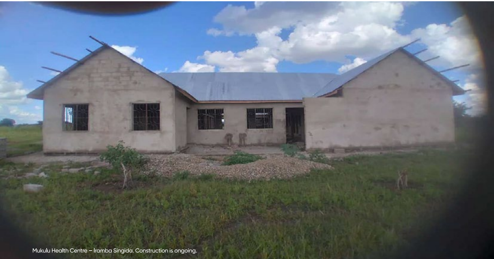
Mukulu Health Centre – Iramba Singida. Construction is ongoing.