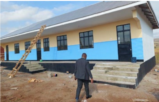
New Shikizi Primary School Manyara. Handover to be done during 2024 AGM.