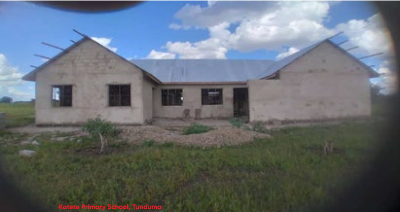
Katete Primary School, Tunduma

The bank developed a dedicated special needs classroom, ensuring inclusive learning for students with disabilities.