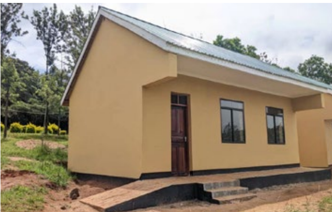
Endagikot Primary School Mbulu –Manyara, One class for special need students and their special desks. Handover during the AGM