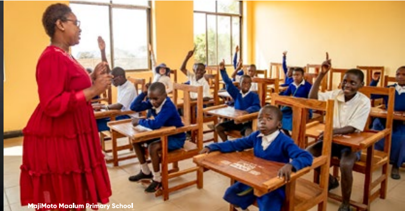
MajiMoto Maalum Primary School